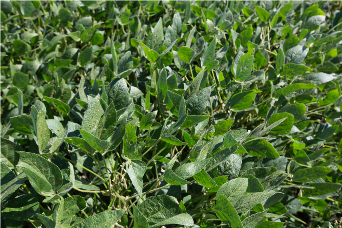
Research Soybean Field Image.